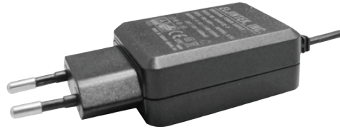
FIG 2: European