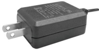
FIG 1: American