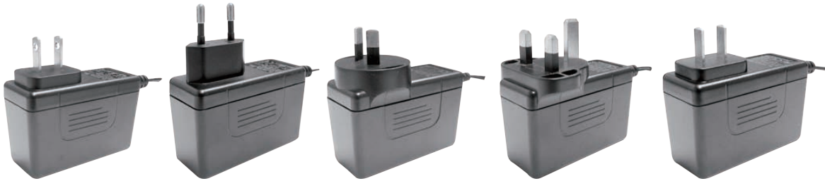
FIG 1: American