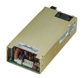
E Type (Enclosed with end built-in fan): 3.2(W) x 6.5(L) x 1.6(H) inches