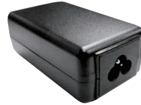
FIG 3: IEC-320-C6