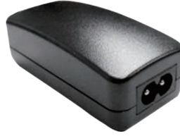
FIG 2: IEC-320-C8