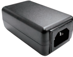
FIG 1: IEC-320-C14