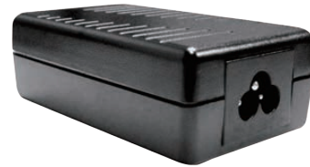
FIG 3: IEC-320-C6