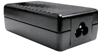
FIG 3: IEC-320-C6