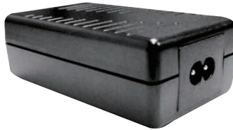
FIG 2: IEC-320-C8