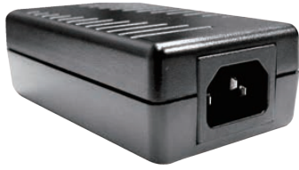
FIG 1: IEC-320-C14