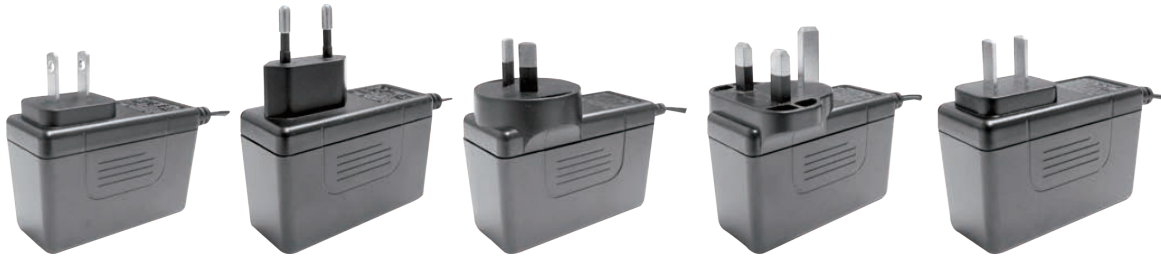
FIG 1: American