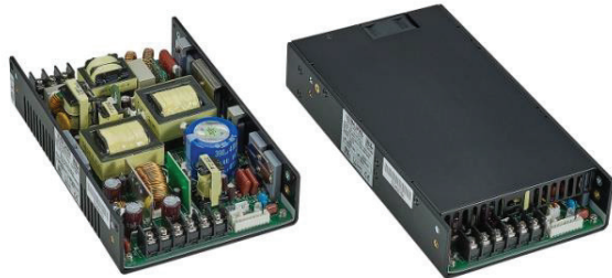
RL0402U Series (U-Chassis Type): 8(L) x 5(W) x 1.6(H) inches. RL0402E Series (Enclosed Type): 9(L) x 5(W) x 1.6(H) inches.