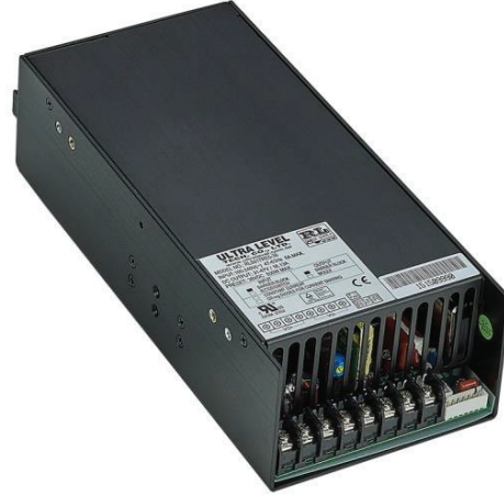
Enclosed with built-in fan Type: 9.2(L) x 4.3(W) x 2.5(H) inches.