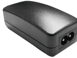
FIG 2: IEC-320-C8