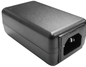
FIG 1: IEC-320-C14