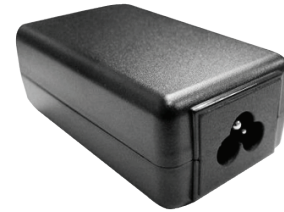
FIG 3: IEC-320-C6