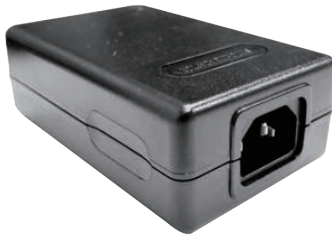
FIG 1: IEC-320-C14