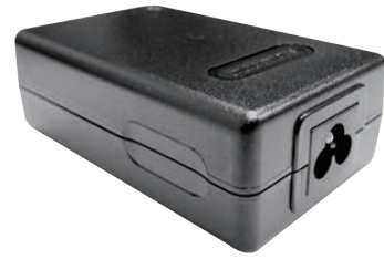
FIG 3: IEC-320-C6