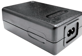
FIG 2: IEC-320-C8