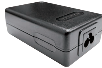
FIG 3: IEC-320-C6